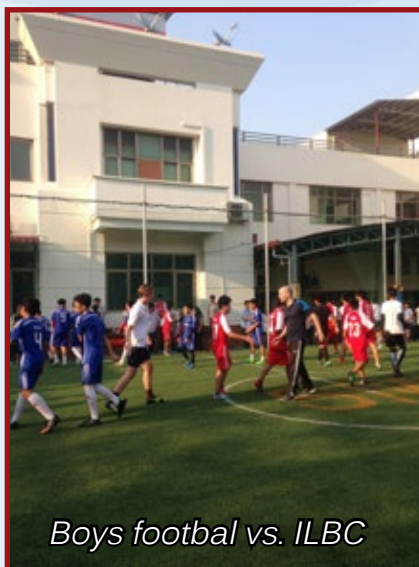
Boys football vs. ILBC