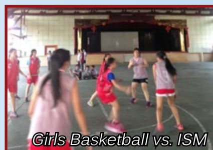
Girls Basketball vs. ISM

to a victory over Yangon Academy and a very close loss to a top ISM team. Both the boys and girls teams will be playing in the MISAC tournament next Saturday. Keep up the Griffin pride!