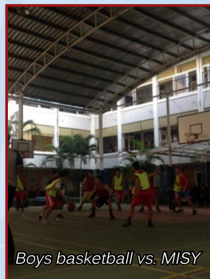
Boys basketball vs. MISY

to a victory over Yangon Academy and a very close loss to a top ISM team. Both the boys and girls teams will be playing in the MISAC tournament next Saturday. Keep up the Griffin pride!