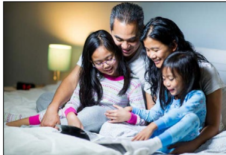
Children are made readers on the laps of their parents. - Emilie Buchwald

Reading to your children daily is the very best thing you can do to help them achieve the most academic success possible.