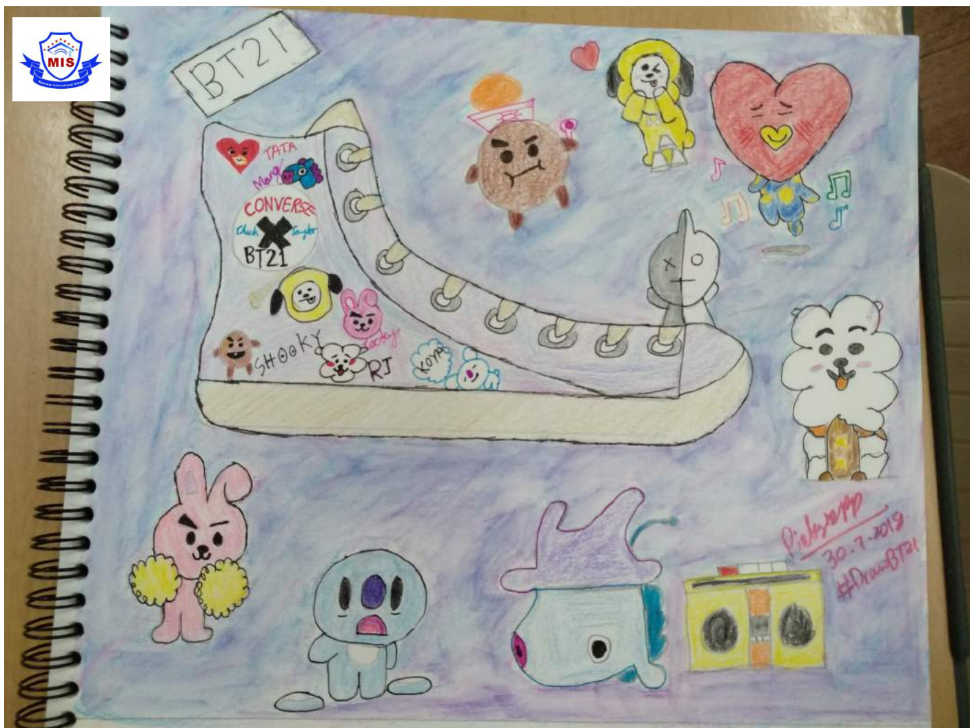
August — September 2018 — Myanmar International School International News—1st edition